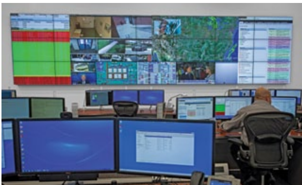
▲ American Water's control room display wall comprises 21 ultra-narrow bezel LCD flat panels from Christie.