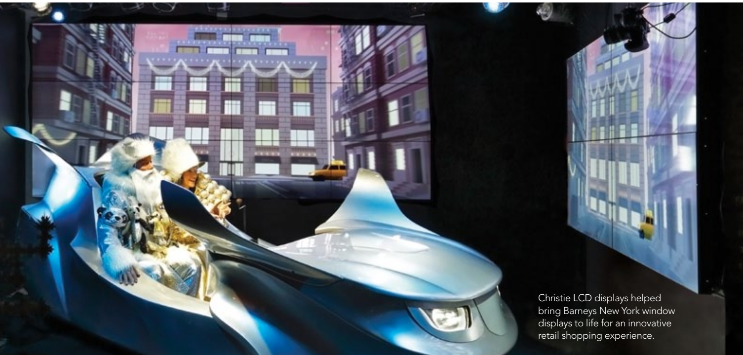
Christie LCD displays helped bring Barneys New York window displays to life for an innovative retail shopping experience.